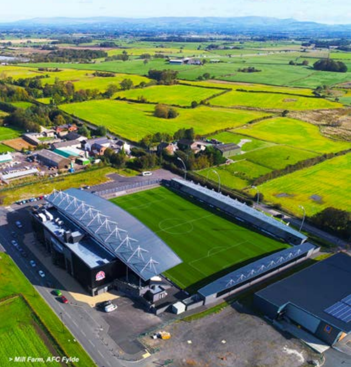
> Mill Farm, AFC Fylde

architecture • project management • structural engineering • interior design building surveying • m&e design • quantity surveying • cdm consultancy